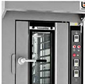
FR mini gas or diesel