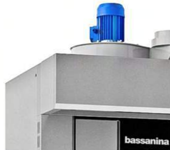
FR compact 57