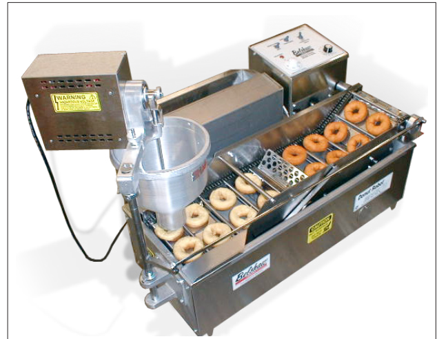
Donut Robot® Mark II Gas with Donuts

The Donut Robot® Mark II Gas makes excellent yeast-raised donuts with the addition of accessories such as FT42 Feed Table , Proofing Trays , and Proofing Cloths .