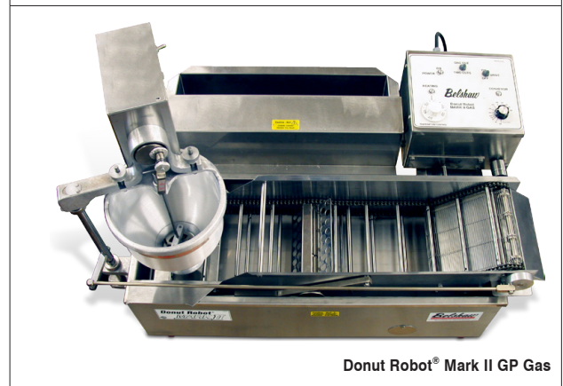
Donut Robot® Mark II GP Gas