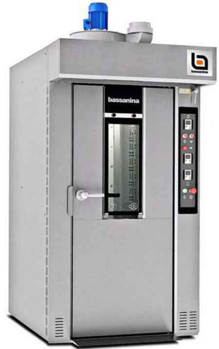
FR compact 57