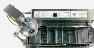
Donut Robot® Mark II