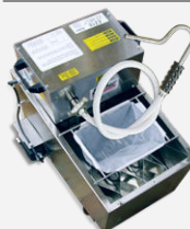
EZ Melt 18