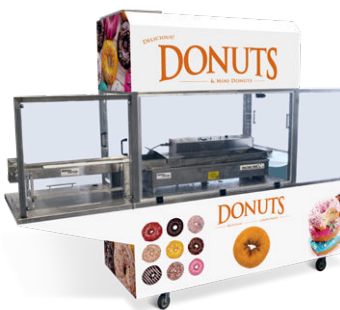
INSIDER with Feed Table extension for yeast raised donuts (optional).