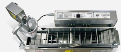
Donut Robot® Mark V