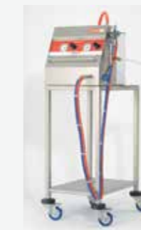
Complete with trolley and compressor